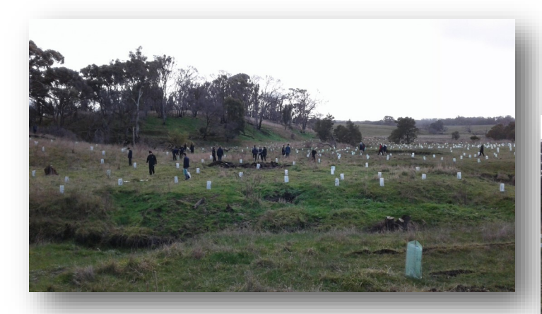
Covenant College students tree planting, Williamsons Creek, Elaine

The local community assisted delivering the tree planting component of these projects. Secondary school students, local businesses, and prisoners in Landmate Program helped plant the trees.