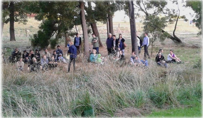
Above left: Brunch with the Birds event at Ditchfield Reserve in Brown Hill; Above right: Frog Walk and Talk. Middle left: Botanic Drawing by the River event. Middle right: Soil testing as part of the Small Farm Planning workshops. Below: New Cal-