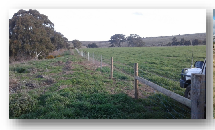
Fencing Leigh River, Bamganie to prevent livestock Access to stream and protect Remnant Vegetation.