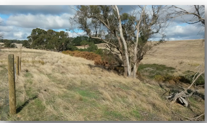
Fencing, Gorse and Blackberry Control on the Yarrowee River, Grenville.